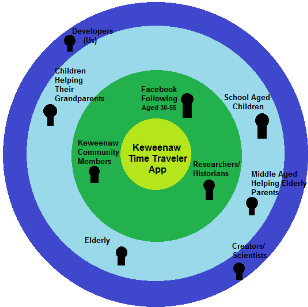
Figure 2: Onion Model for Stake Holders